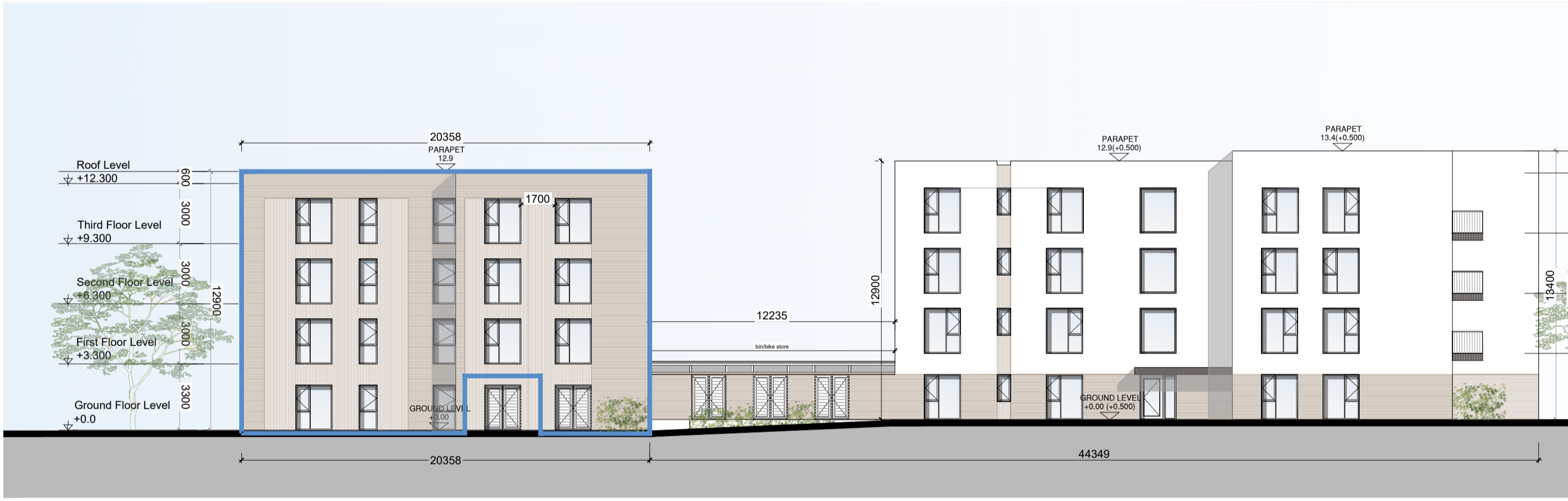
BLOCK B - NORTH ELEVATION