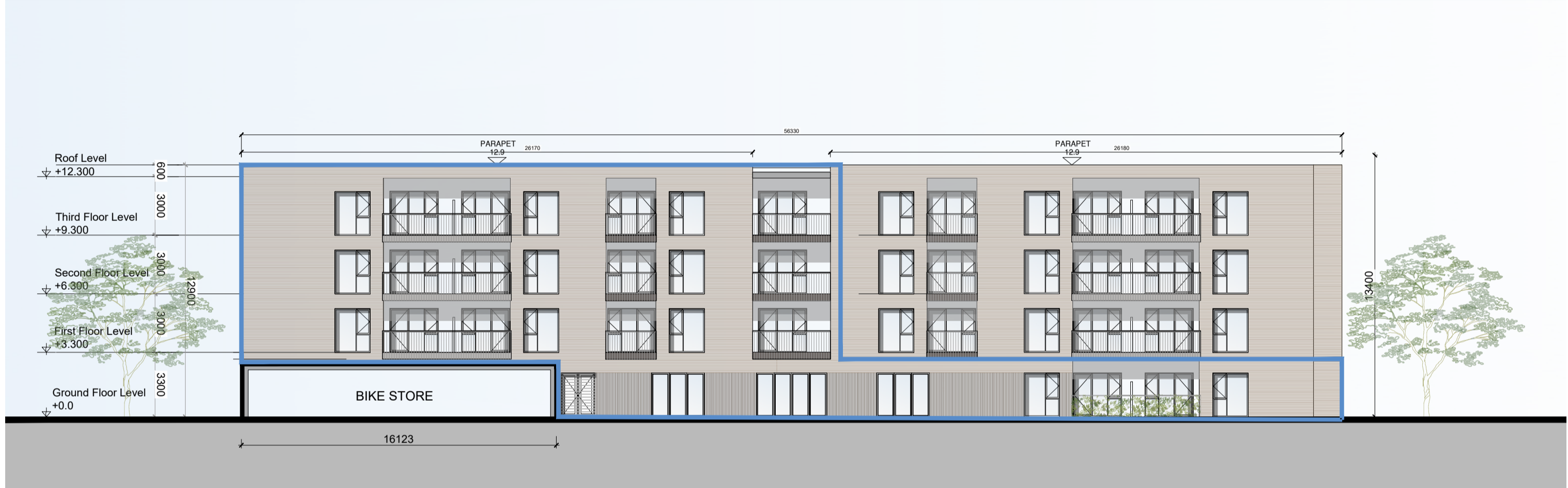
BLOCK B - WEST ELEVATION