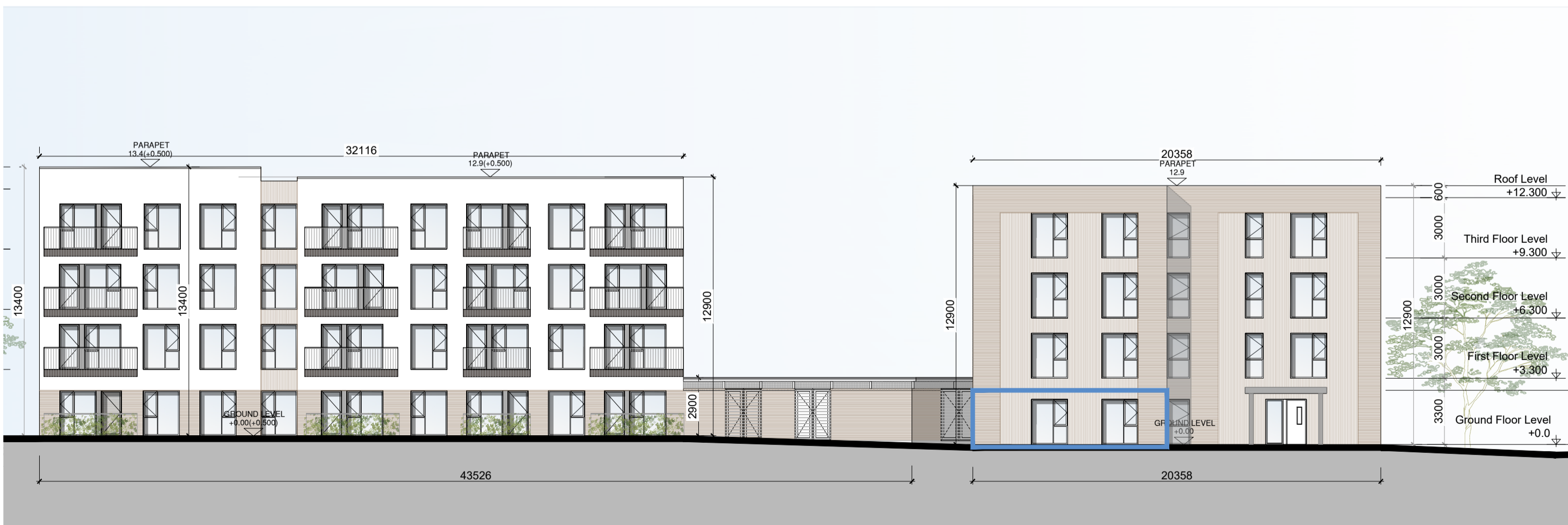
BLOCK B - SOUTH ELEVATION

NOTES: DO NOT SCALE FROM DRAWINGS. WORK TO FIGURED DIMENSIONS ONLY. ARCHITECT TO BE NOTIFIED OF ALL DISCREPANCIES.