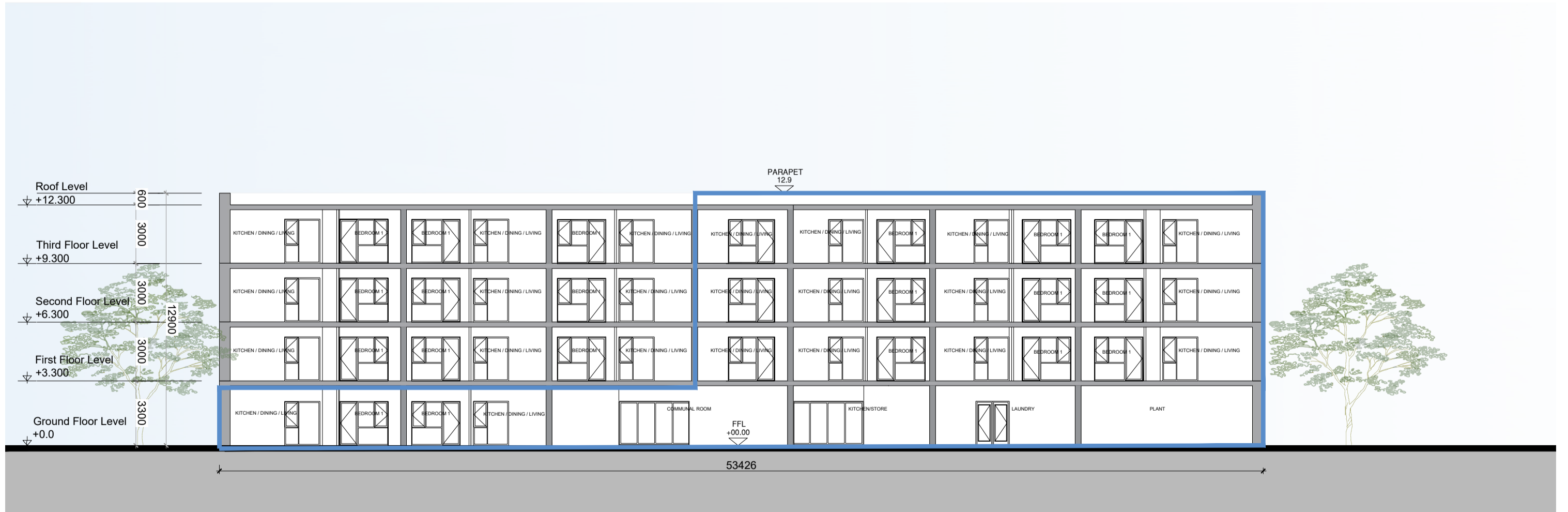
BLOCK B - SECTION A