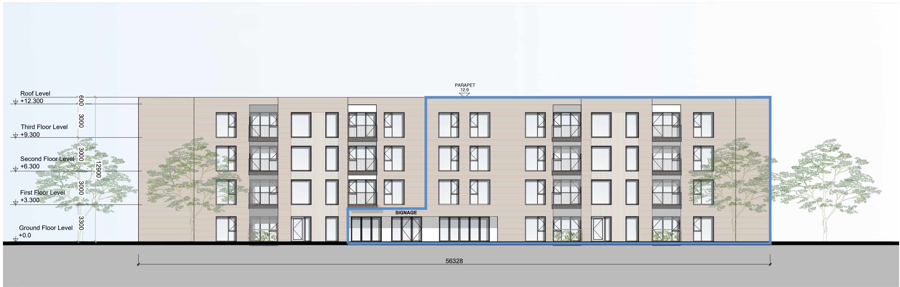
BLOCK B - EAST ELEVATION